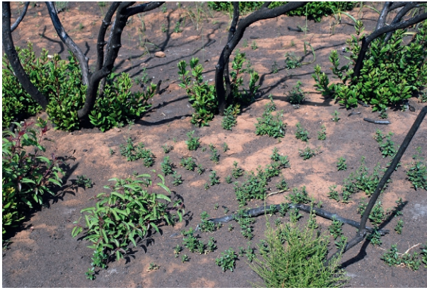
FIGURE 7.3 A large variety of chaparral plant species quickly resprout from underground lignotubers after a fire. In addition, the germination of seeds of obligate seeding (non-resprouting) shrubs is stimulated by heat, charred wood, or smoke. Resprouting species shown include chamise ( Adenostoma fasciculatum ; front right), two laurel sumac ( Malosma laurina ; center left), and three mission manzanita ( Xylococcus bicolor ). Obligate seeding Ceanothus tomentosus seedlings are pictured in the middle of the photo. Note the diameter of the burned stems. The lack of small twigs indicates a high-severity fire.

central Chile, South Africa, southwestern Australia, and the Mediterranean Basin) (Keeley, 2012). In particular, the likely scenario for chaparral-dominated wildfires in California before human settlement was one of large, infrequent fires (once or twice per century) that were ignited by lightning in forested areas at higher elevations during the moderate summer monsoon period between August and September. Remnants of the fire, such as smoldering logs, persisted into the fall. When extreme weather variables coincided, for example, several years of drought, low humidity, high temperature, and strong winds, the fire would have reignited and rapidly spread. Fires stopped when they reached the coast or when the weather changed. Today fires ignited at higher elevations during monsoonal storms are extinguished, and at lower elevations fires are vastly more frequent as a result of human-caused ignitions (Keeley, 2001).