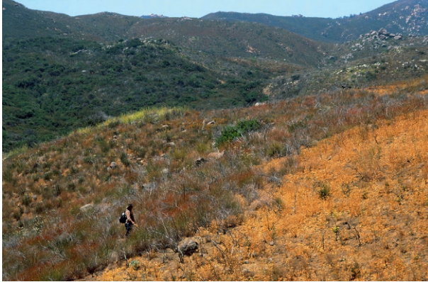
FIGURE 7.8 The impact of excessive fire on chaparral. The entire area shown was burned in 1970. The middle/left area burned again in 2001 and is returning with a full complement of native chaparral species. In the right portion, which burned again in 2003, obligate seeding species are absent, the number of resprouting species has been reduced, and nonnative weeds have invaded. The interval between the last two fires was too short, causing a dramatic reduction in biodiversity and leading to type conversion. The location pictured is near Alpine, San Diego County, California.

California Fire Plan, San Diego County claimed that chaparral burned in both the 2003 and 2007 wildland fires “remained chaparral and is recovering” (Steinhoff, 2010). In fact, much of the chaparral in question was not recovering well at all because of the loss of several keystone shrub species, and it was showing significant invasion by nonnative grasses (Keeley and Brennan, 2012) (Figure 7.8).