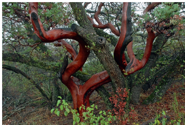
FIGURE 7.5 Old-growth chaparral in San Diego County, California. A big-berry manzanita ( Artocostaphylos glauca ) has wrapped itself around an Engelmann oak ( Quercus engelmannii ). The manzanita is estimated to be over a century old.

1996). While trees will overtop and shade out chaparral in areas with higher annual rainfall and richer soil conditions than exist in the vast majority of chaparral sites, the general belief that chaparral will eventually disappear because of age is not supported by data (Keeley, 1992).