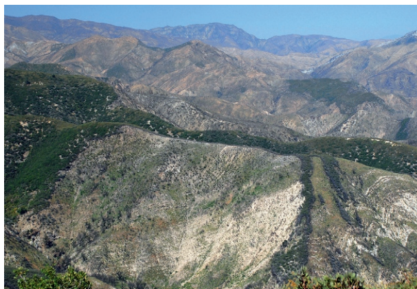
FIGURE 7.4 The 2007 Zaca Fire burned more than 97,200 ha in the Los Padres National Forest, the third-largest recorded fire in California after the 1889 Santiago Canyon Fire and the 2003 Cedar Fire. Although there are unburned patches within the perimeter (note vegetation strips at the lower right, along the central ridge, and the unburned area to the left), wherever the flames burned, they did so at high intensity/high severity. The fire burned over the entire scene shown in the photo.

need to be concerned with the spread of combustible, non-native weeds and increased ignitions caused by millions of additional people on the landscape.