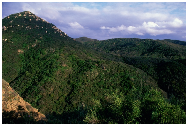
FIGURE 7.1 Chaparral is a unique plant community characterized by large, contiguous stands of drought-hardy shrubs, a Mediterranean-type climate, and infrequent, high-intensity/high-severity crown fires.

resulting in cognitive dissonance as new scientific information has emerged. The fire suppression paradigm asserts that a century of fire suppression policy has eliminated fires and allowed vegetation (fuels) to accumulate to unnatural levels so that today when wildfires begin they burn uncontrollably, often producing catastrophic effects (Keeley et al., 1999). For many plant communities, especially chaparral, little could be further from the truth. Data for the past 100 years show that despite a policy of fire suppression, wildfires have not been able to be eliminated in most southern California landscapes; in fact, fires are more common today than historically. Because of this misconception about fire suppression, managers have been trained to believe that wildfires are fuel-driven events and, as a consequence, can be controlled by modifying vegetation.