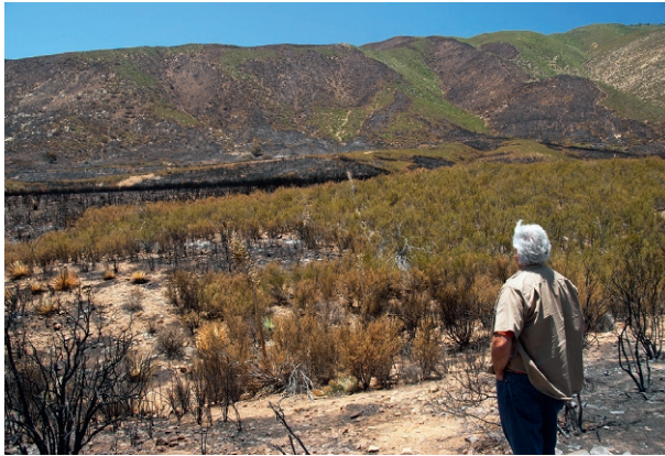
FIGURE 7.9 Photo shows an escaped, 40 ha prescribed fire in the San Felipe Valley Wildlife Area, San Diego County, California, that ultimately burned more than 1000 ha, most of which was 11-year-old desert chaparral. Considering the ecological fragility of the area because of its age and the multiple fires that have burned much of the valley over the previous decade, there likely will be a significant reduction of biodiversity in the region.

extensively (DeBano, 1981, Hubbert et al., 2006) and was first identified after chaparral fires. The hydrophobic soils theory suggests that because of the gas released by burning plants and soil litter, hot fires create an impermeable “waxy layer” a few inches below the surface. According to popular accounts, this layer then prevents water from permeating the ground, causing large chunks of topsoil to break loose during rain storms and slide down the hill (LAT, 2014). Warnings about the hazards of such waterproof layers are commonly raised by the media after fires.