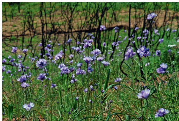
FIGURE 7.6 A large number of fire-following annuals and short-lived perennials emerge from the soil seed bank after a high-intensity chaparral fire. In addition, geophytes emerging from underground tubers, like this brodiaea ( Dichelostemma capitatum ), are likely stimulated to flower by additional sunlight provided by the removal of the chaparral canopy by fire. (Tyler and Borchert (2007)).

substances in the soil, thereby releasing the seeds from inhibition and suggesting the need for fire. One problem with this explanation is that the soil chemicals suspected of suppressing growth actually increase after a fire (Christensen and Muller, 1975).