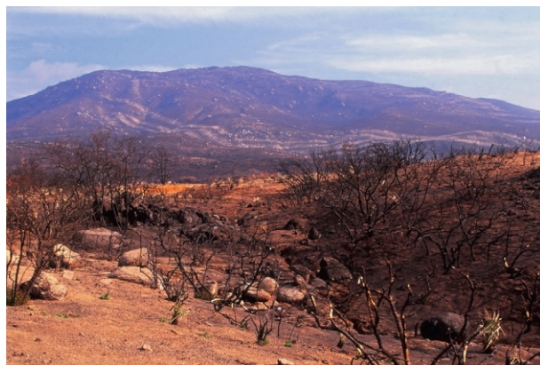
FIGURE 7.10 Postfire treatments in chaparral are costly and often of questionable value. Strips of mulch were dropped by aircraft on the side of the Viejas Mountain in San Diego County after the 2003 Cedar Fire.

To justify the clearance of native chaparral habitat, the Arizona Game and Fish Department claimed that “. . . catastrophic wildfire in the chaparral type can burn intensely enough to create hydrophobic soils, reducing soil productivity, increasing erosion, and causing severe downstream flooding” (AGFD, 2007). The City of Los Angeles spent $2 million to spread mulch after the 2007 Griffith Park Fire in part because “. . . chaparral vegetation has a natural tendency to develop water repellent or hydrophobic soils due to their natural high wax content. As a result, burned watersheds generally respond to runoff faster than unburned watersheds. . .” (LACC, 2007).