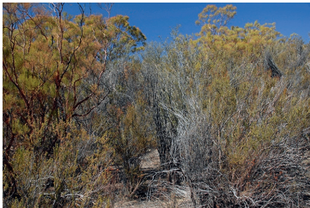
FIGURE 7.2 The natural, physical structure of chaparral shrubs (contiguous fuel from the ground to the crown) and the seasonal pattern of drought create conditions favoring high-intensity/high-severity crown fires.

different authors sometimes leads to considerable confusion (Keeley, 2009). For chaparral, however, severity measures may not be particularly helpful because high-intensity chaparral fires typically burn all the aboveground living material, leaving behind only dead, charred shrub skeletons. Fire severity has been measured by the twig diameter remaining on the terminal branches of shrub skeletons and has been shown to correlate with one measure of fire intensity (Moreno and Oechel, 1989). Even though the mature, aboveground forms of some plant species are killed, the belowground portions remain alive as lignotubers that resprout vigorously within a few weeks after the fire. In the first year after fire, massive numbers of seeds from fire-killed obligate seeding shrubs and fire-following annuals are stimulated by fire cues to germinate in the postfire environment (Keeley, 1987, Keeley and Keeley, 1987). Obligate seeding shrubs are nonsprouting species, like many Ceanothus and manzanita species, that require a fire cue for seed germination. As long as fire arrives above the lower limit of the natural fire return interval of 30-40 years, the severely burned postfire chaparral ecosystem is extraordinarily resilient and vibrant (Figure 7.3).